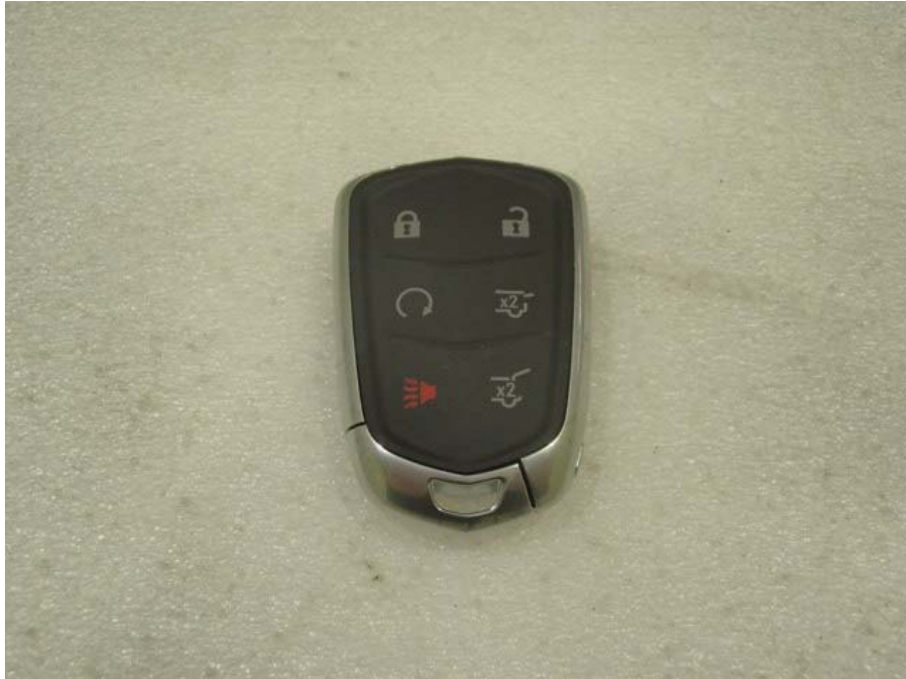
Mechanical Key (Not Inserted) Worst