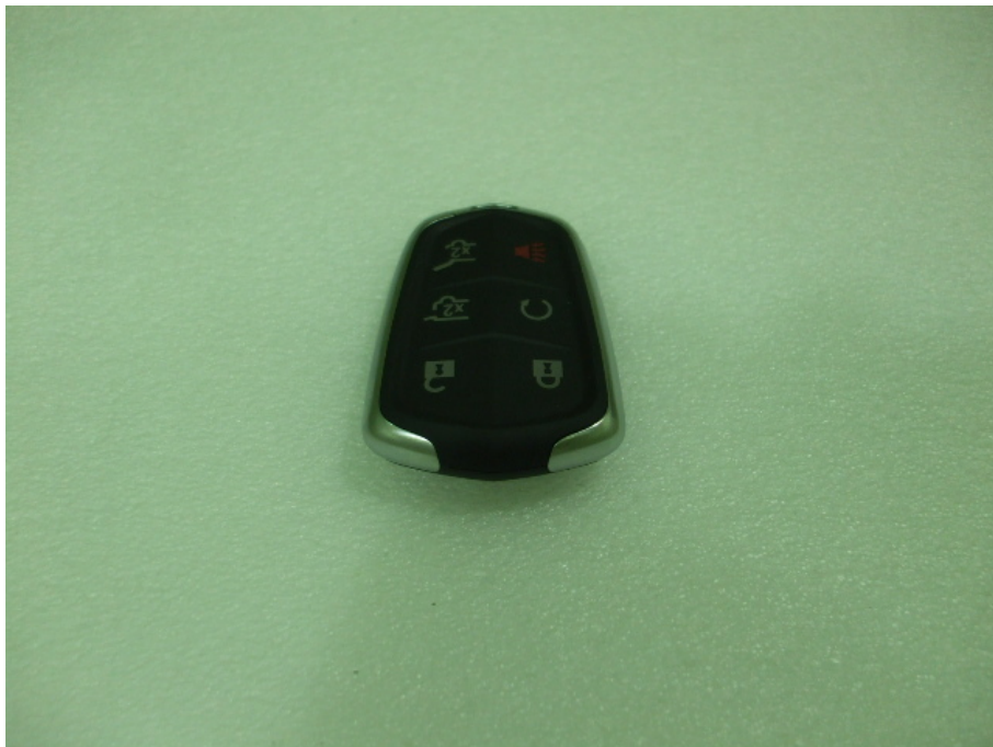
Mechanical Key (Inserted) Worst