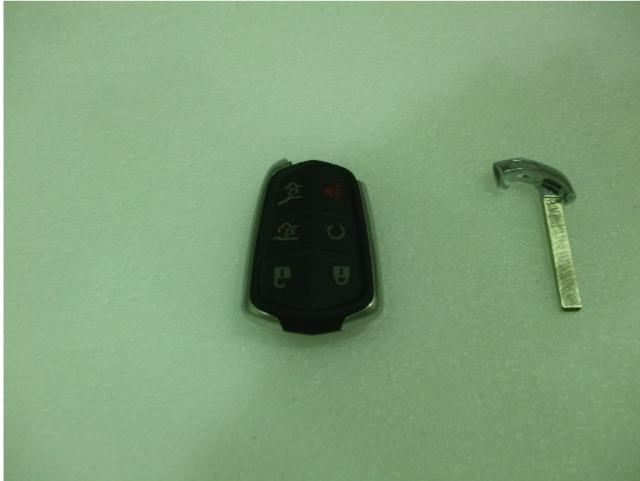
Mechanical Key (Not Inserted)