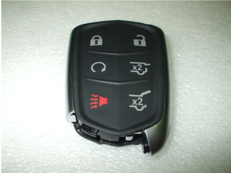
Mechanical Key (Not Inserted)