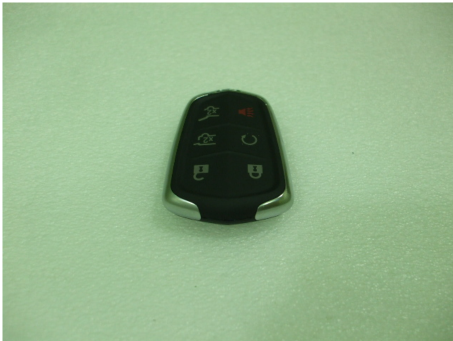
Mechanical Key (Inserted) Worst