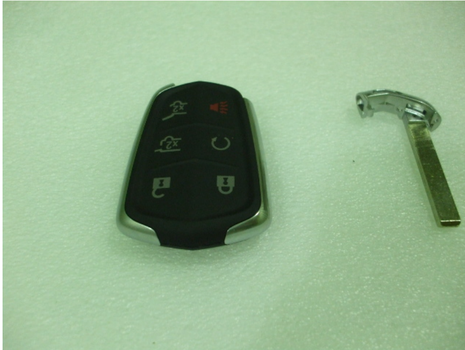
Mechanical Key (Not Inserted)