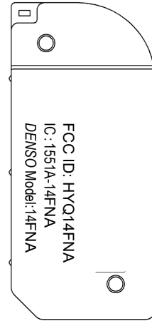
Schematic drawing of a module part