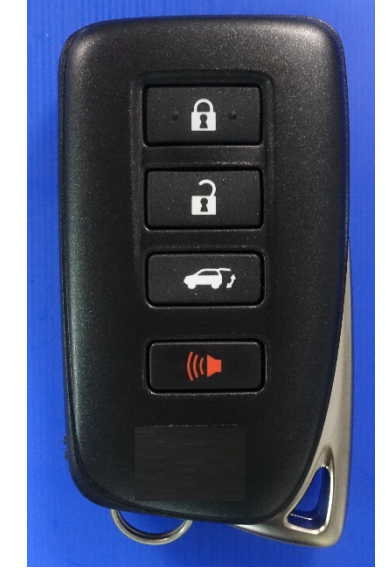
Mechanical Key detached