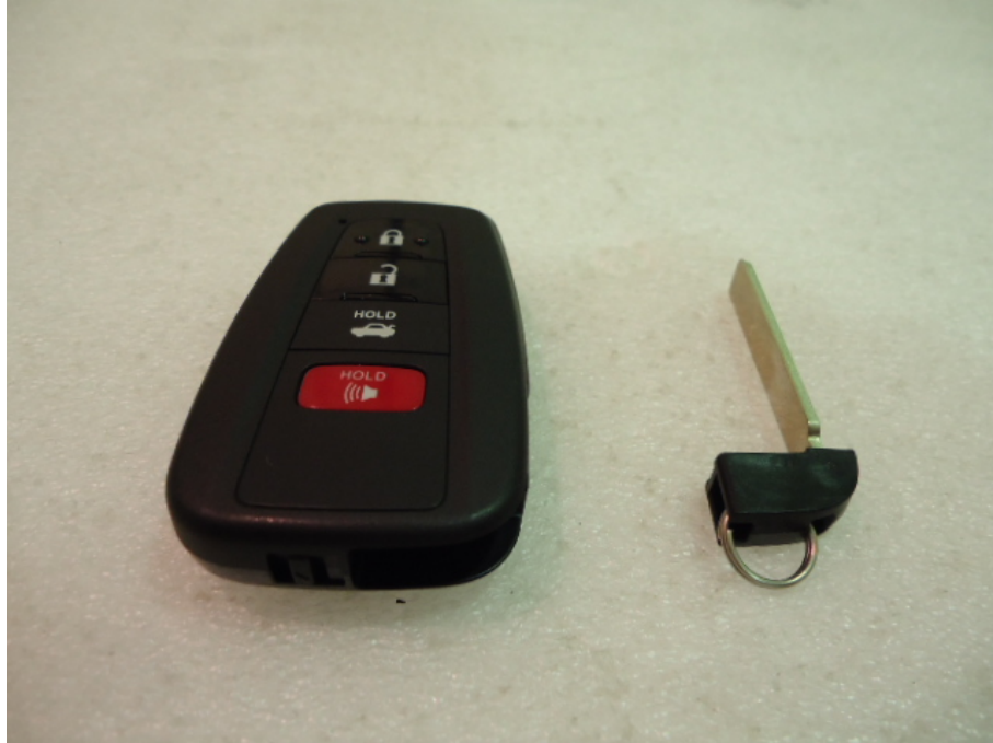
Mechanical Key (Not Inserted)