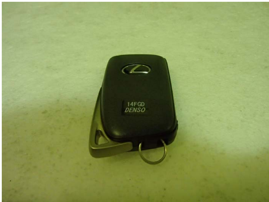
Mechanical Key (Inserted) Worst