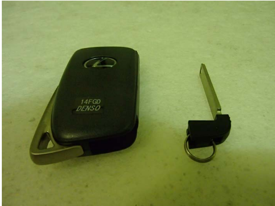
Mechanical Key (Not Inserted)