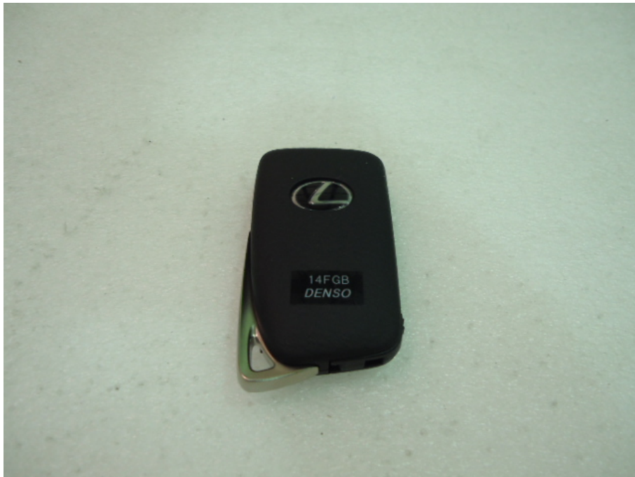
Mechanical Key (Inserted)