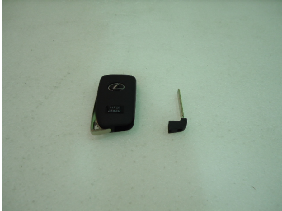
Mechanical Key (Not Inserted) worst case