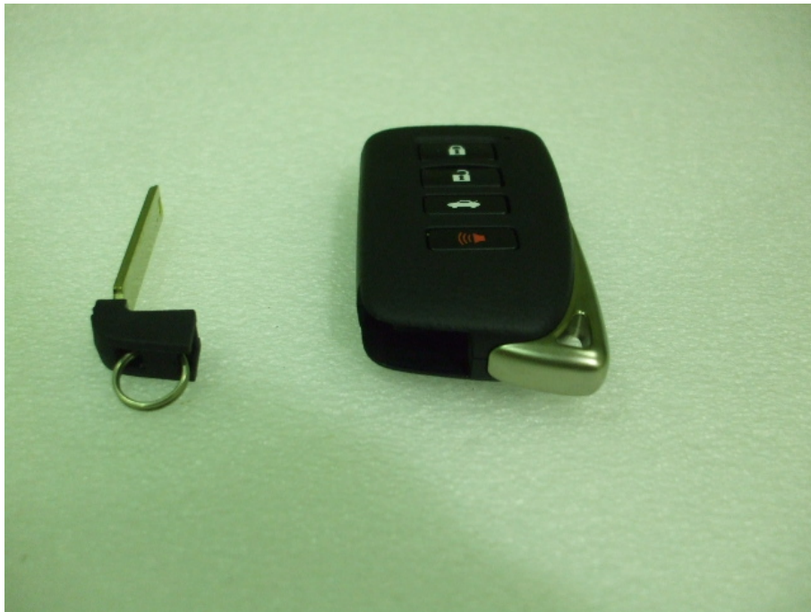
Mechanical Key (Not Inserted)