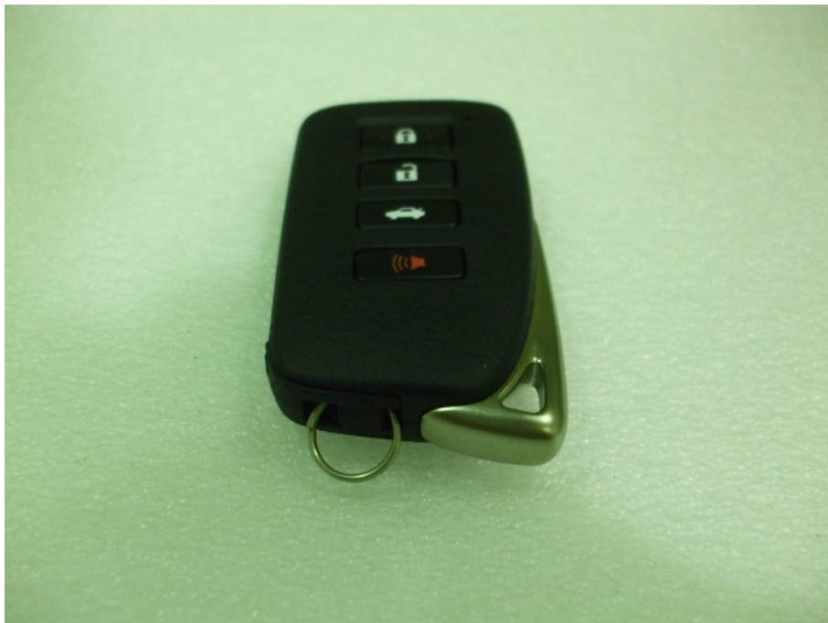
Mechanical Key (Inserted) Worst