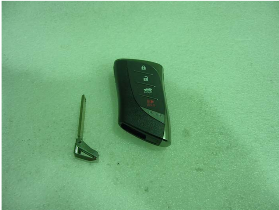
Mechanical Key (Not Inserted)