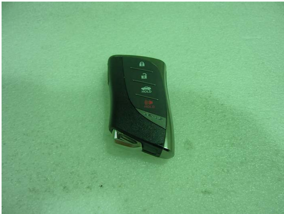
Mechanical Key (Inserted) Worst