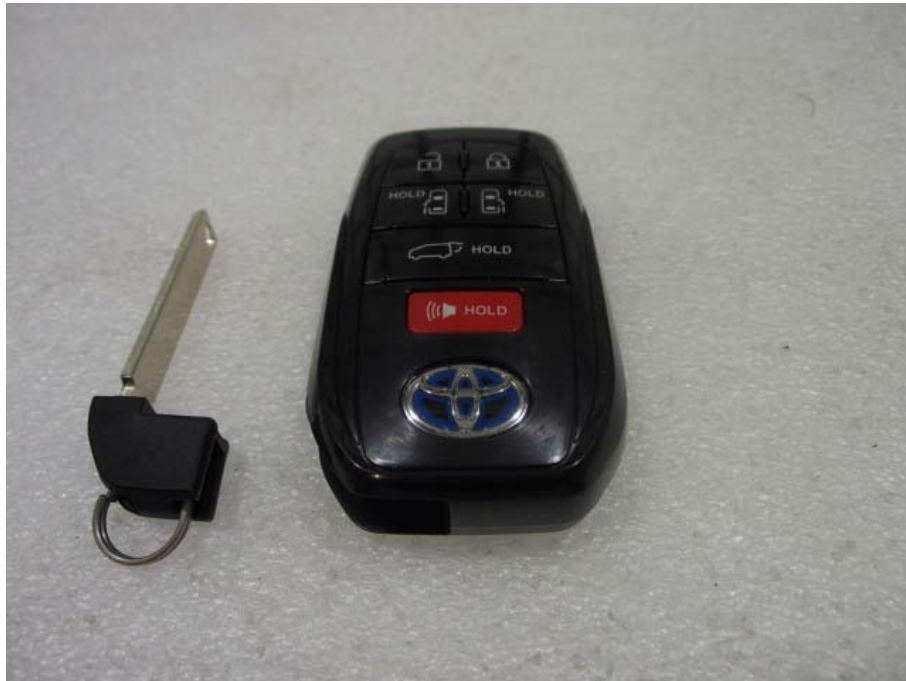
Mechanical Key (Not Inserted)