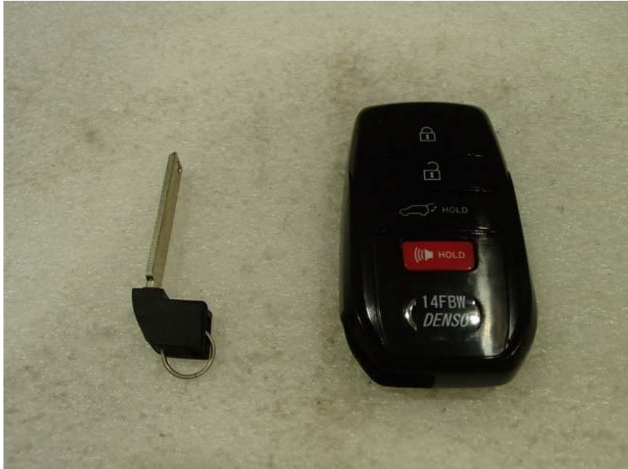
Mechanical Key (Not Inserted)