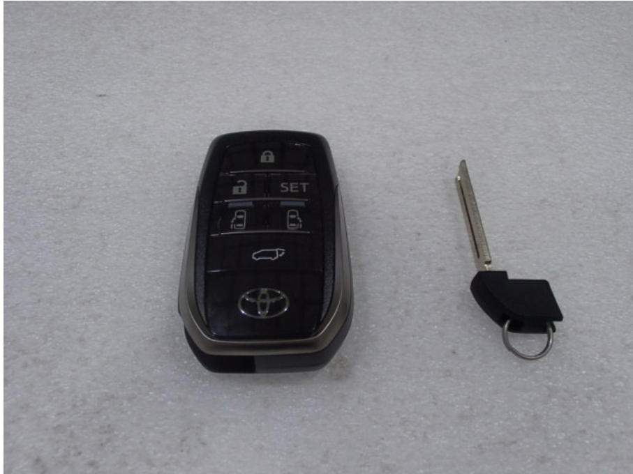
Mechanical Key (Not Inserted) Worst