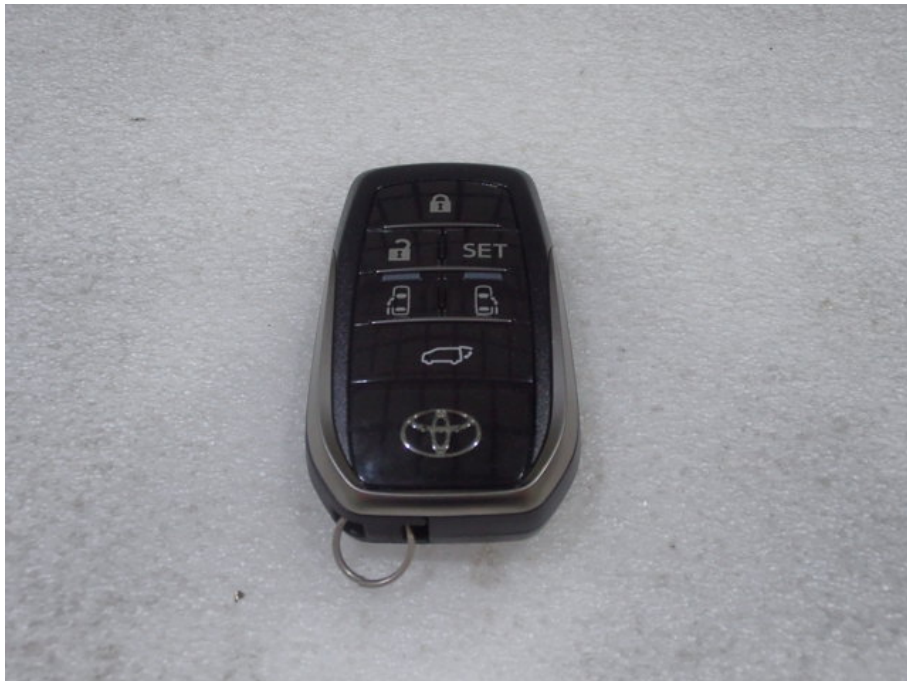
Mechanical Key (Inserted)