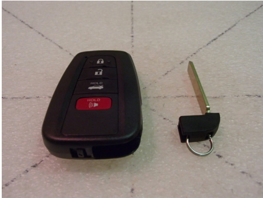
Mechanical Key (Not Inserted)