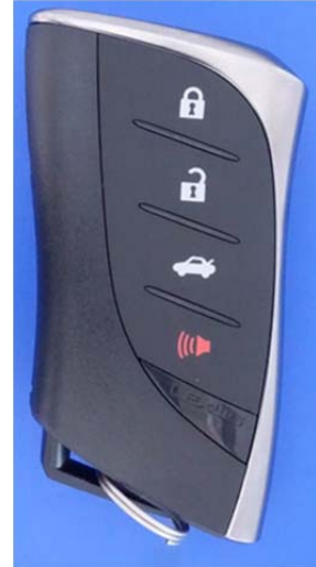
Mechanical Key attached