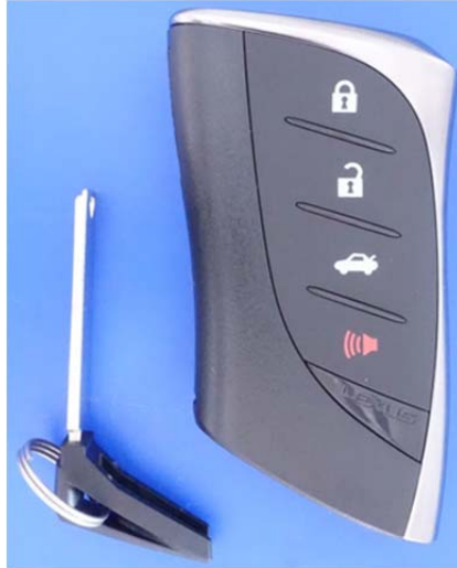
Mechanical Key detached