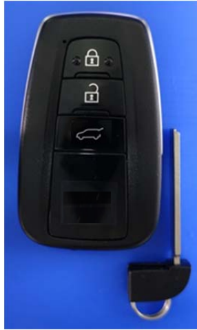
Mechanical Key detached