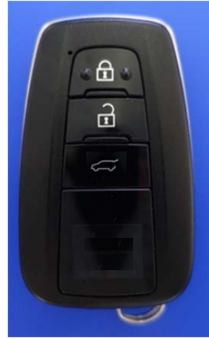
Mechanical Key attached