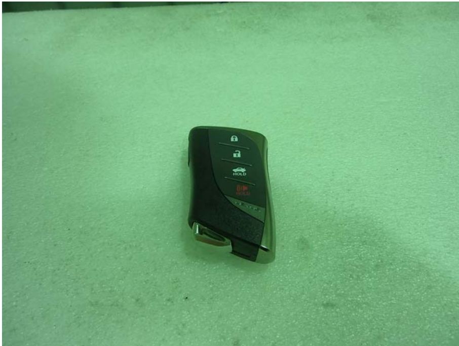
Mechanical Key (Inserted) Worst