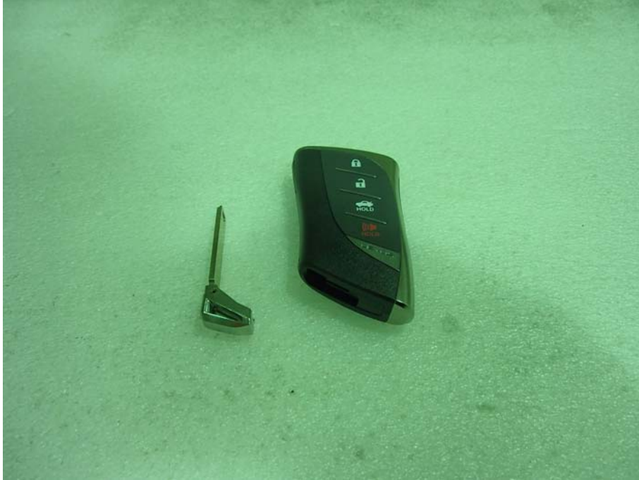
Mechanical Key (Not Inserted)