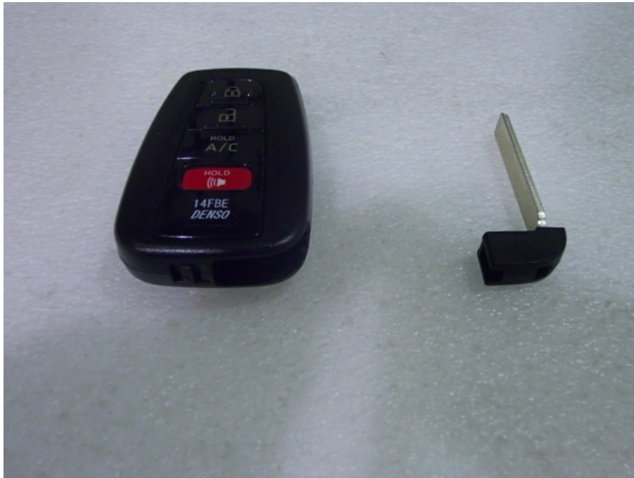
Mechanical Key (Not Inserted)