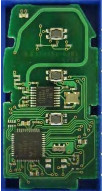
3-Button (Type A)