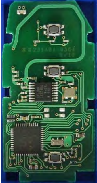
3-Button (Type B)