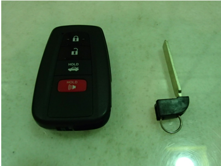
Mechanical Key (Not Inserted)