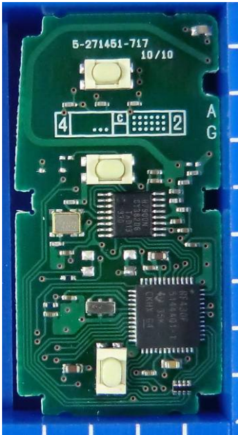
3-Button (Type A)