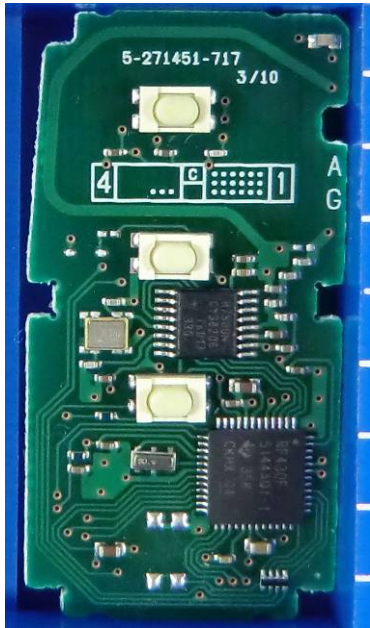
3-Button (Type B)