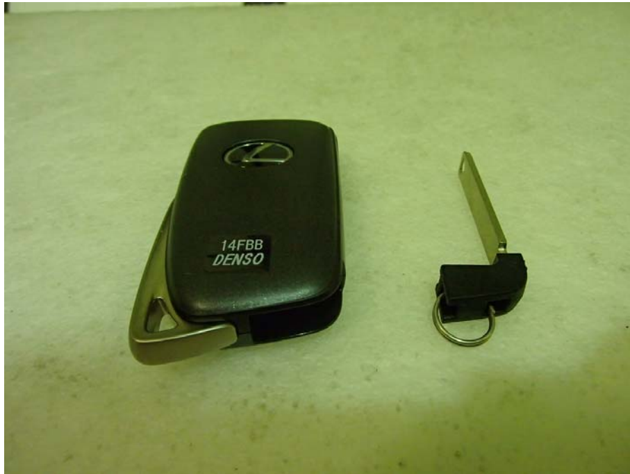
Mechanical Key (Not Inserted) Worst