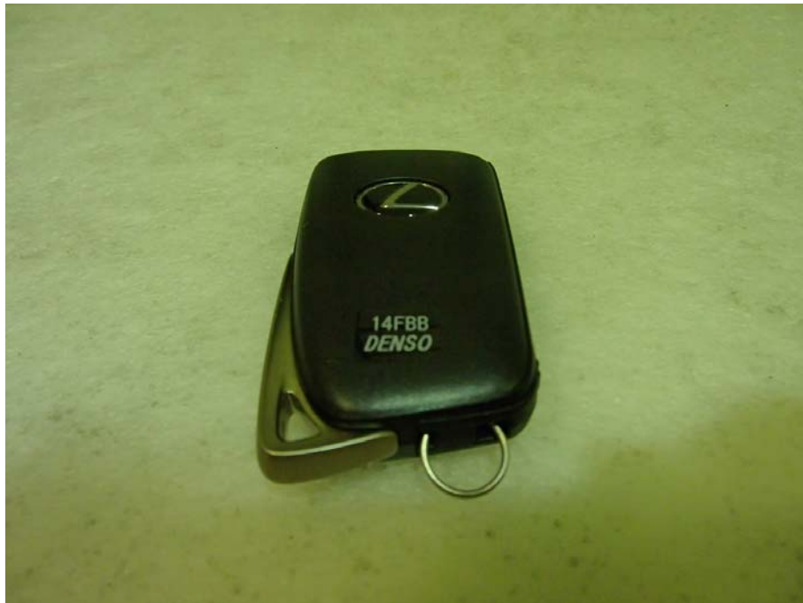
Mechanical Key (Inserted)