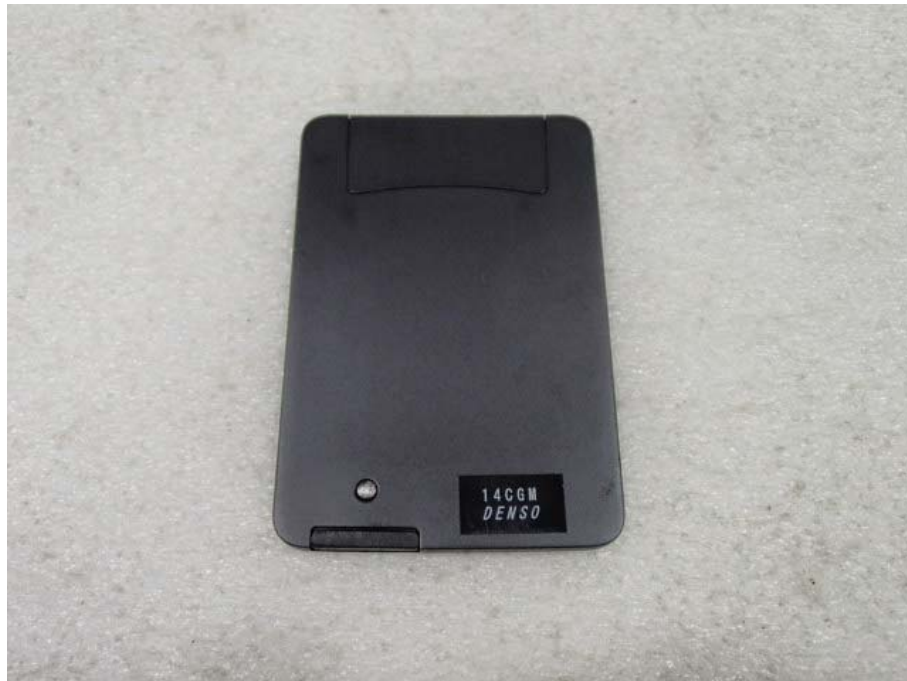
Mechanical Key (Inserted)