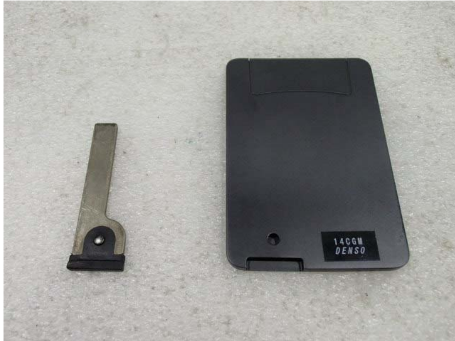
Mechanical Key (Not Inserted) Worst