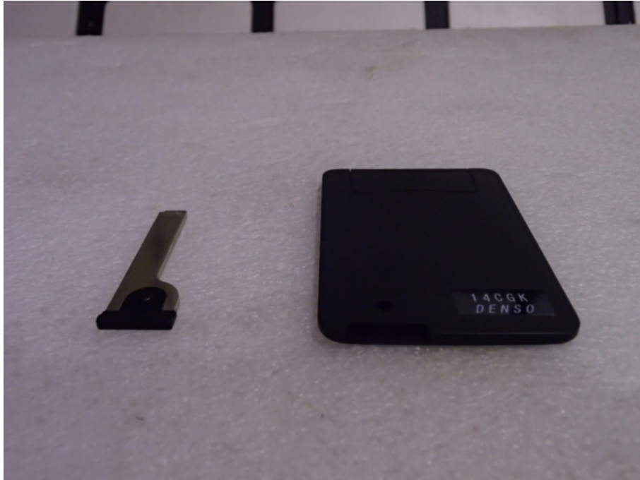
Mechanical Key (Not Inserted) Worst