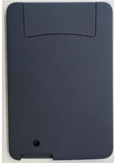
Mechanical Key detached