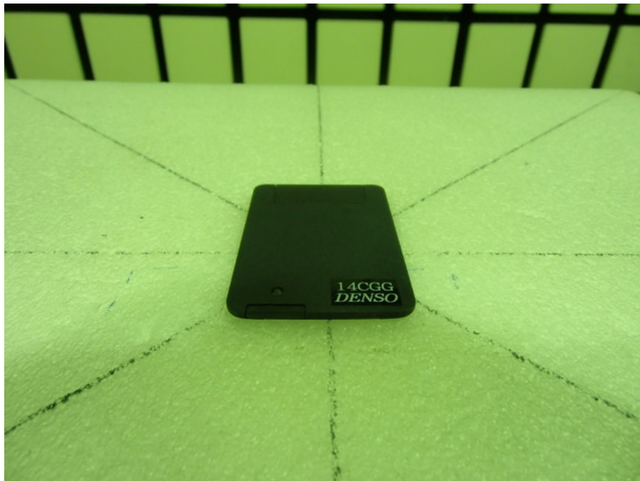
Mechanical Key (Inserted) Worst