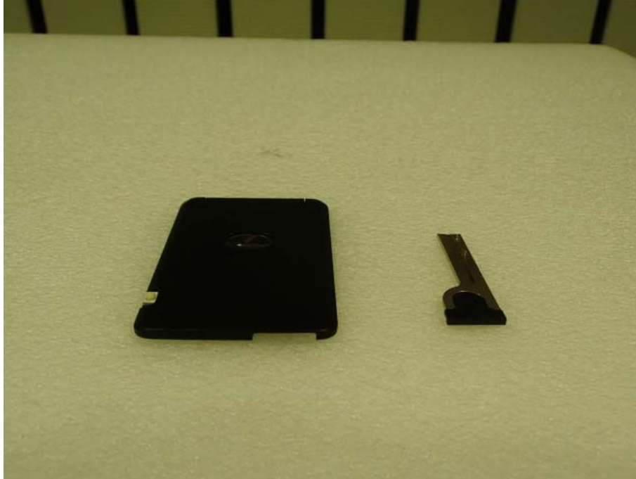
Mechanical Key (Not Inserted) Worst