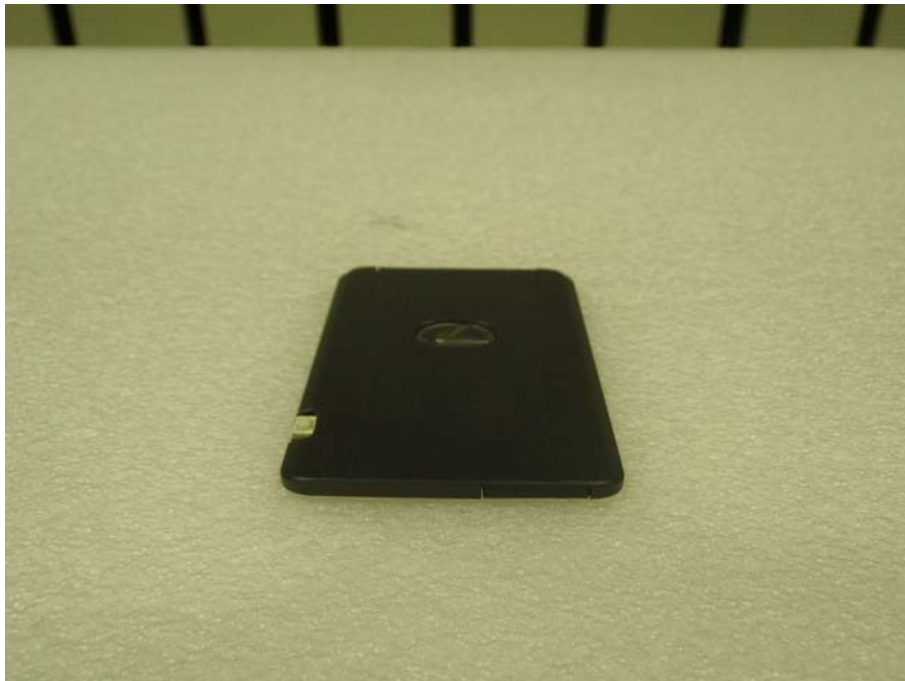
Mechanical Key (Inserted)