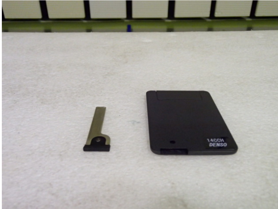
Mechanical Key (Not Inserted)