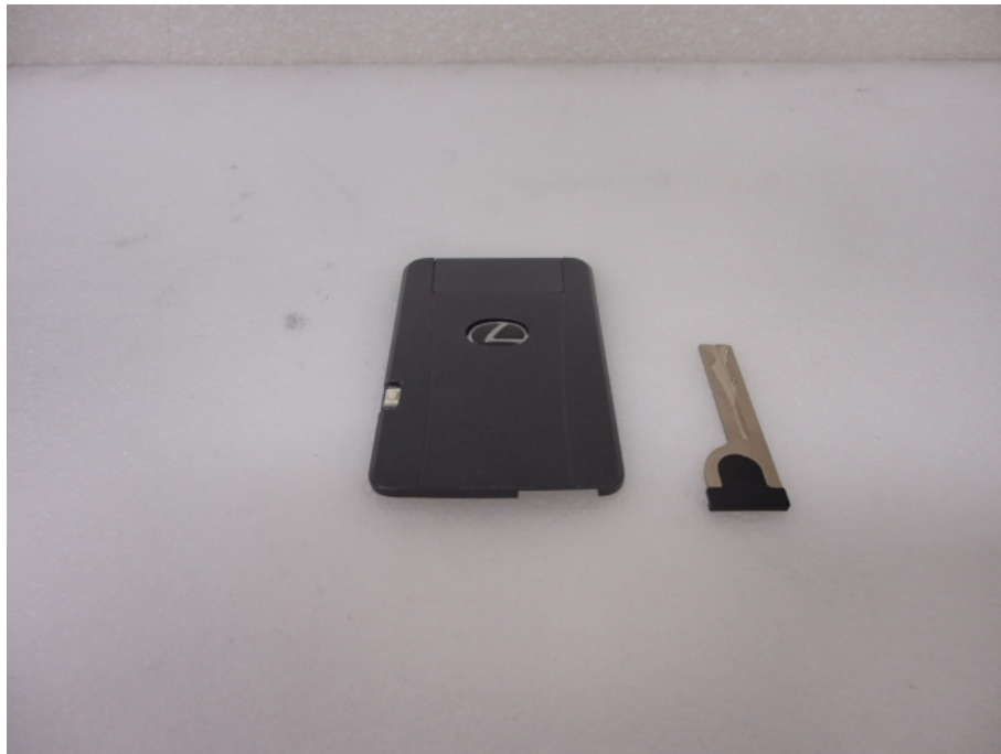
Mechanical Key (Not Inserted)