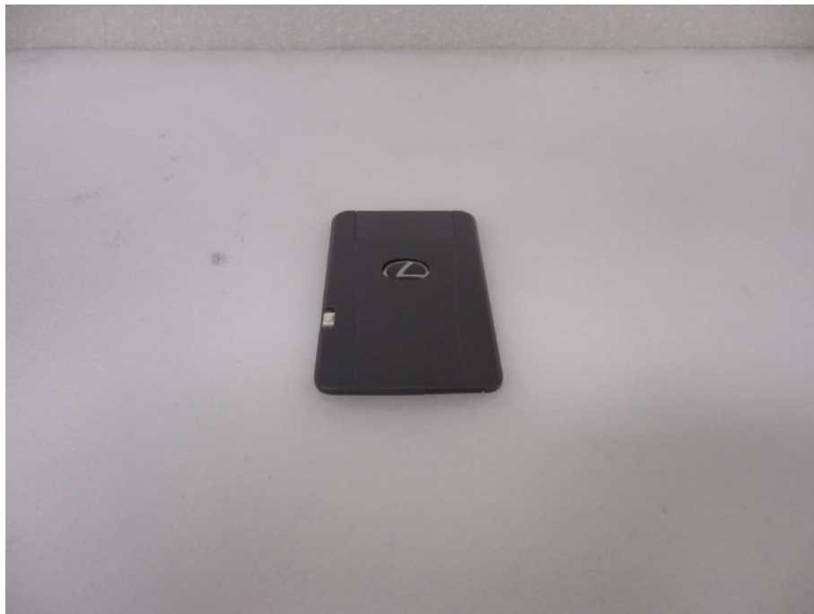
Mechanical Key (Inserted) worst case