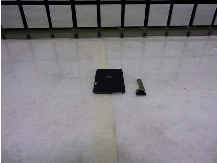
Mechanical Key (Not Inserted) Worst