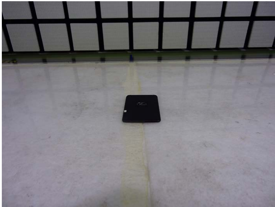
Mechanical Key (Inserted)