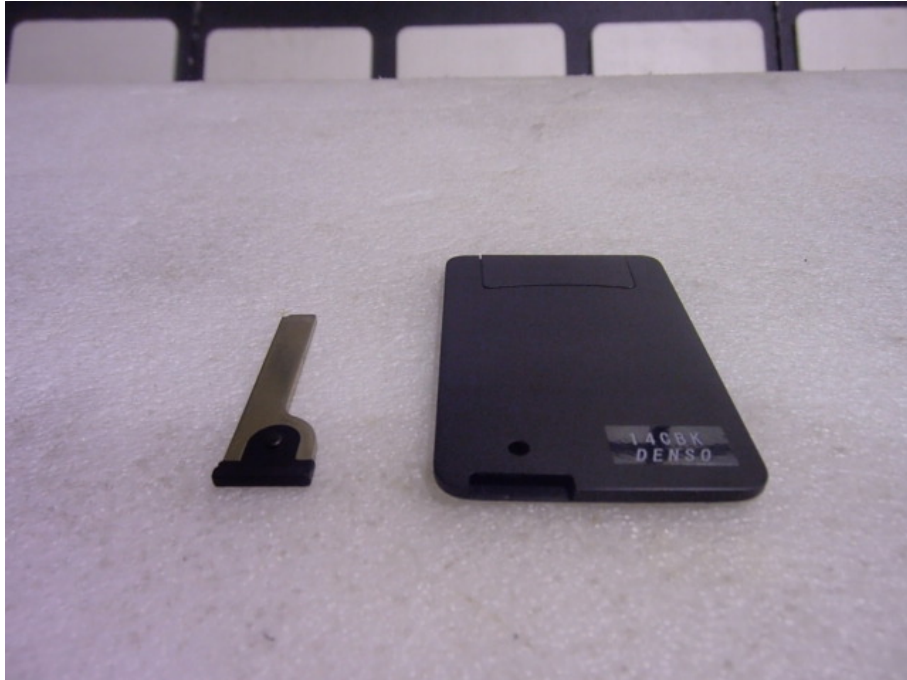
Mechanical Key (Not Inserted) Worst