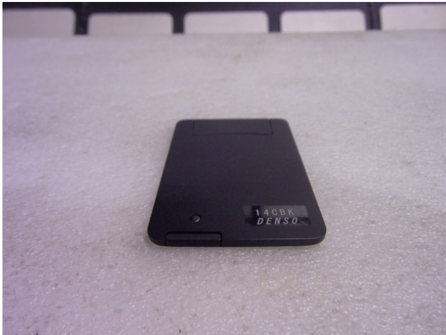
Mechanical Key (Inserted)