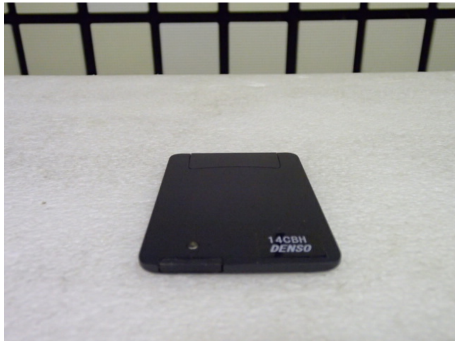
Mechanical Key (Inserted) Worst