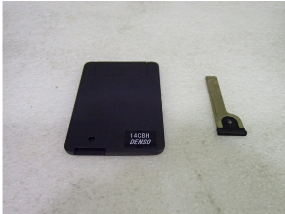
Mechanical Key (Not Inserted)