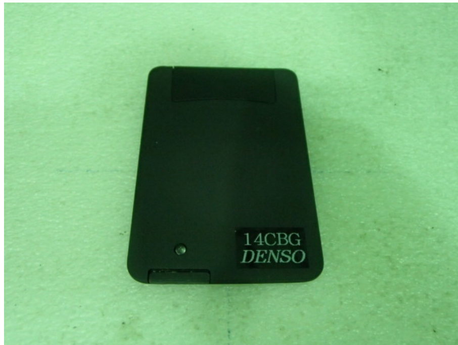
Mechanical Key (Inserted) Worst