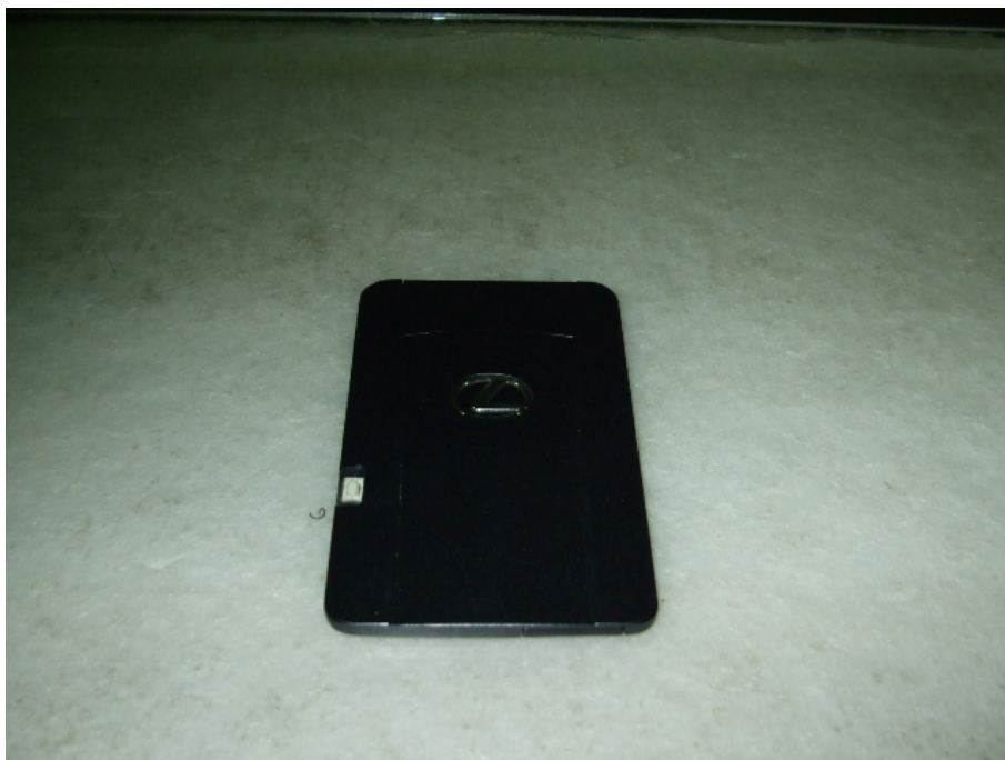
Mechanical Key (Inserted) Worst

NOTE: Mechanical key is made by other manufacturer.