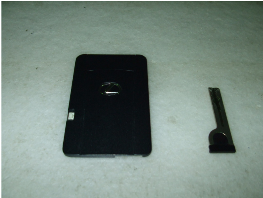
Mechanical Key (Not Inserted)