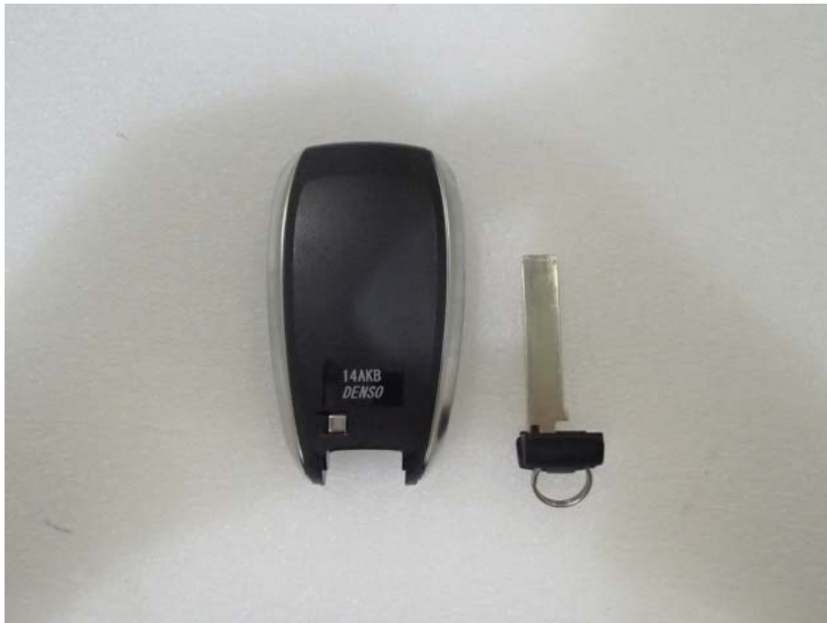
Without mechanical key inserted