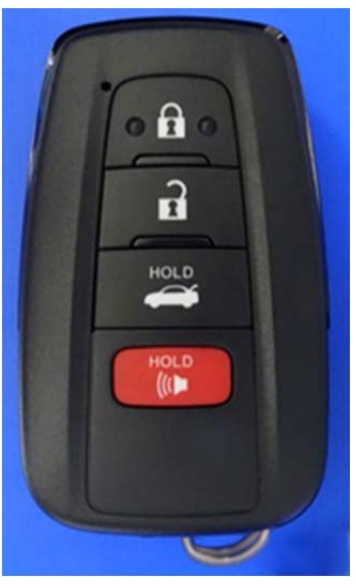
Mechanical Key attached