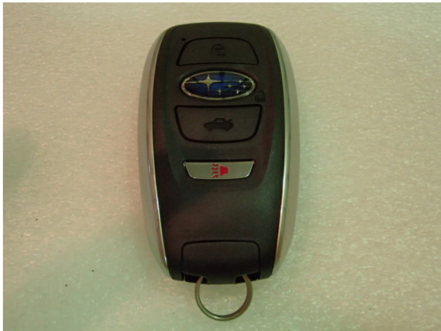
Mechanical Key (Inserted) Worst