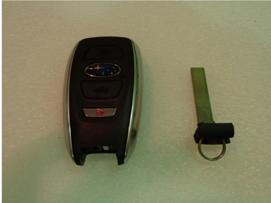
Mechanical Key (Not Inserted)