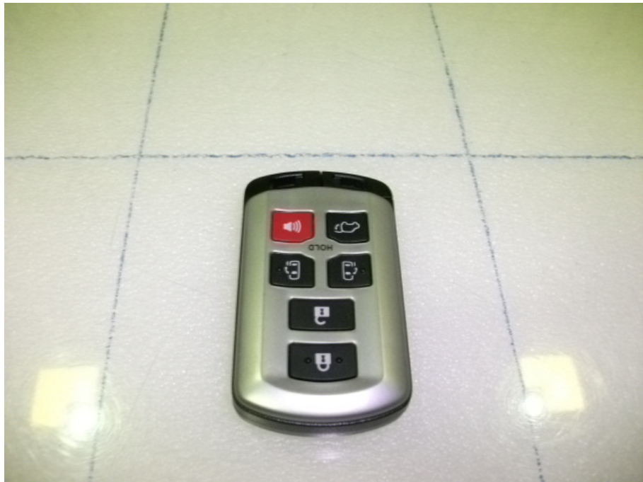
Mechanical Key (Inserted)