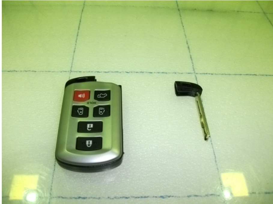
Mechanical Key (Not Inserted) Worst