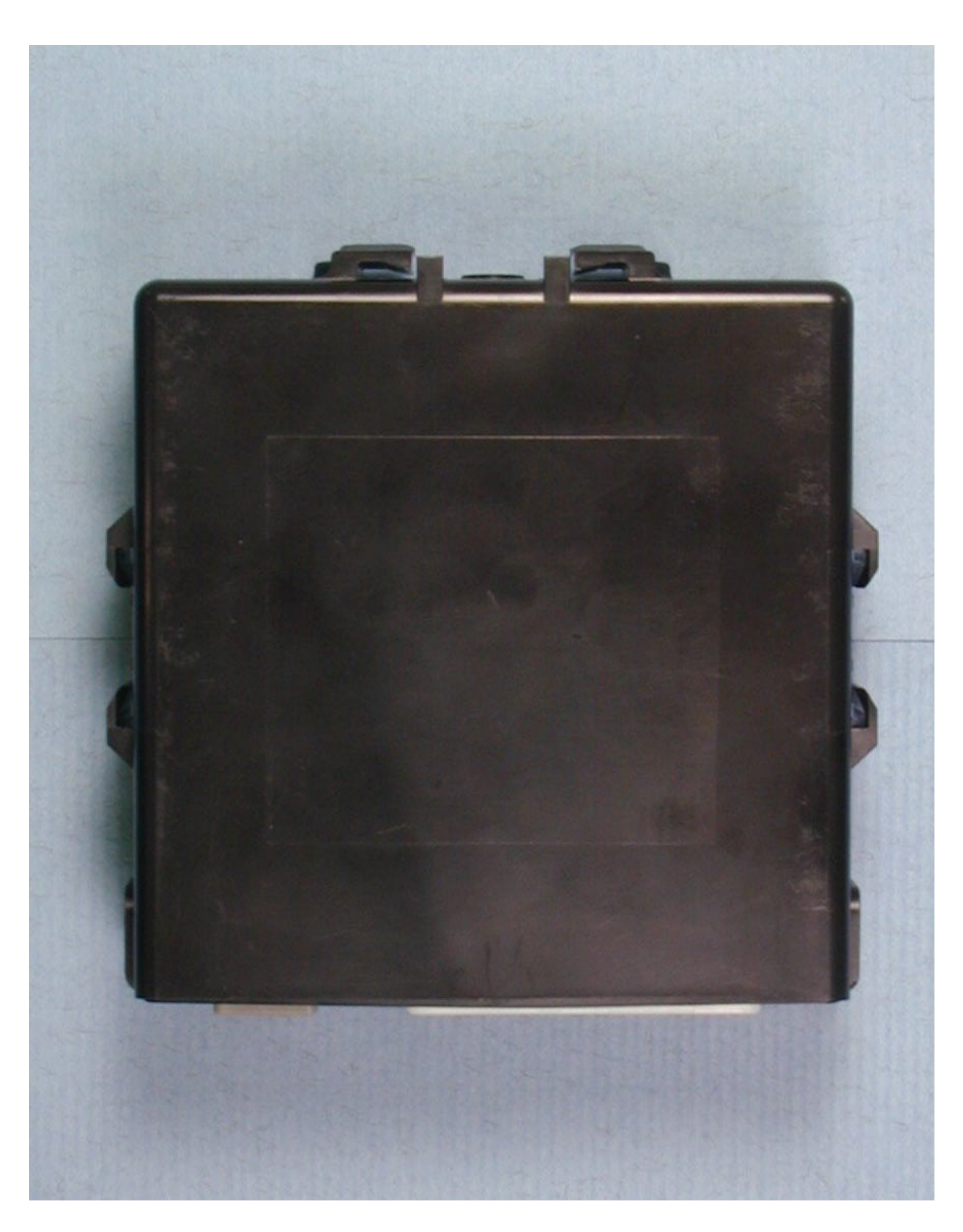
Rear View of Receiver