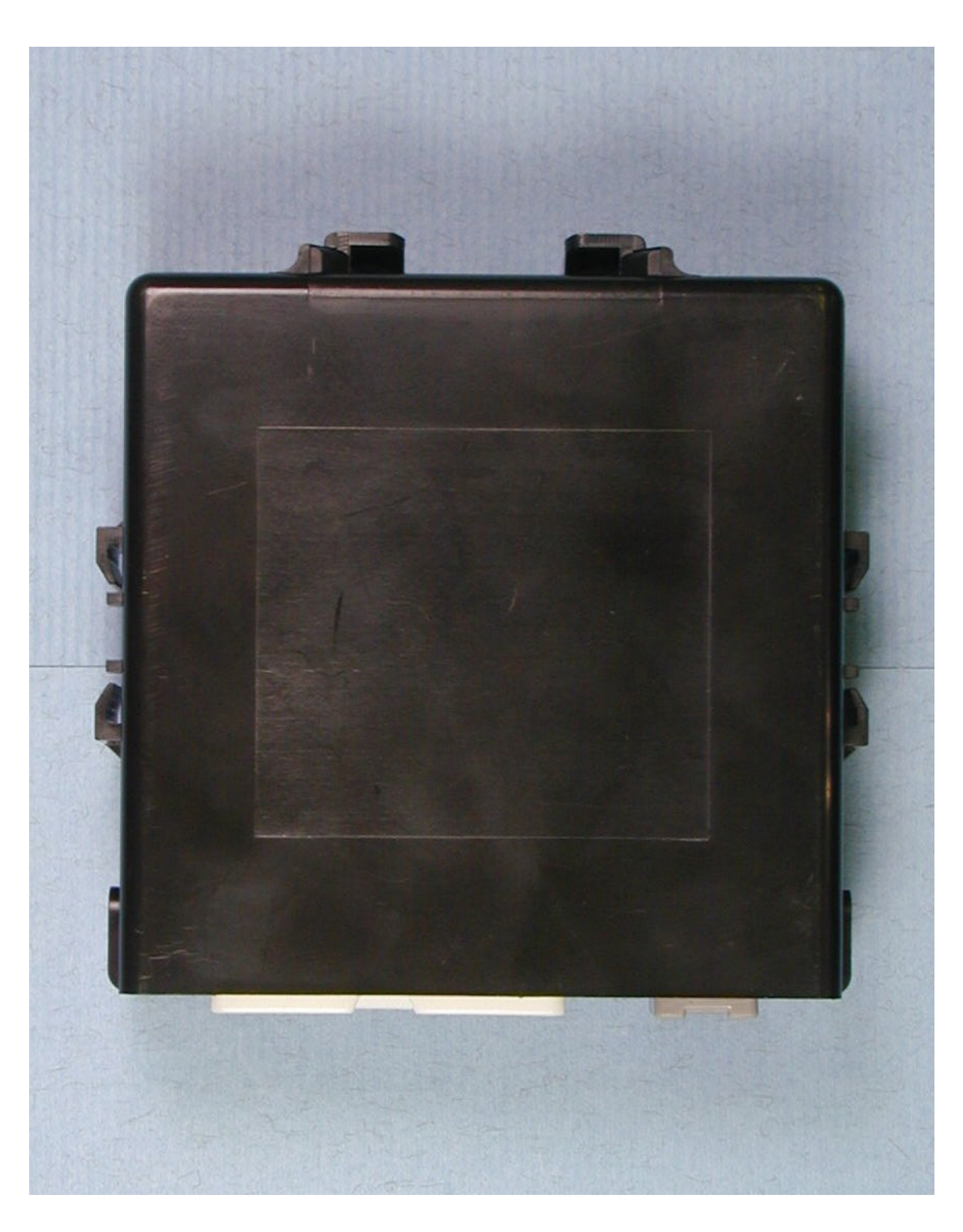
Front View of Receiver