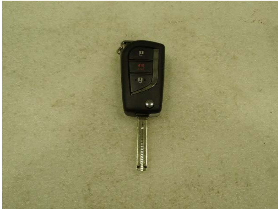
Mechanical Key (Not Inserted) Worst