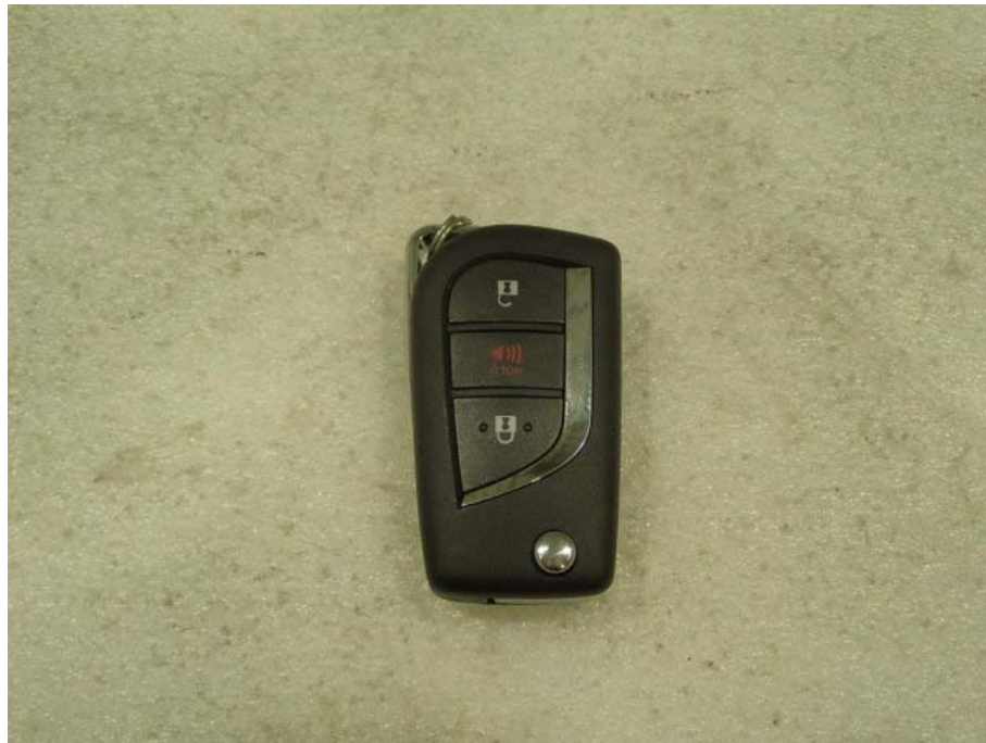
Mechanical Key (Inserted)