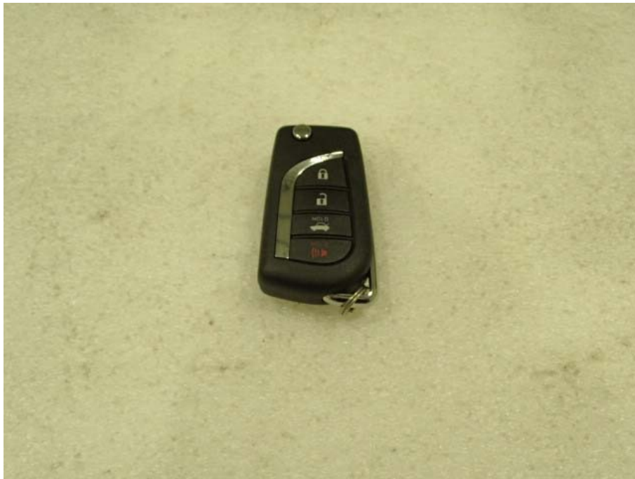
Mechanical Key (folded in) Worst