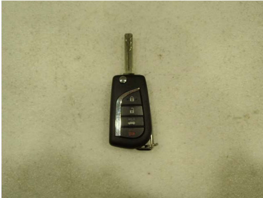
Mechanical Key (folded out)