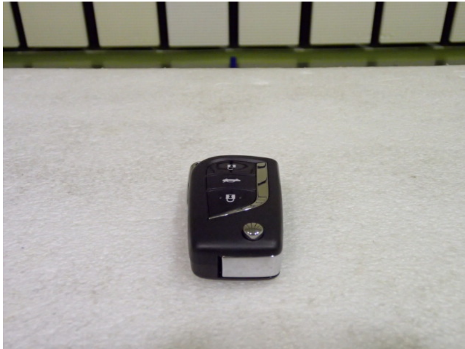
Mechanical Key (folded in) Worst