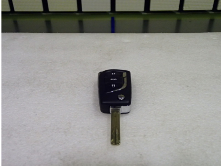
Mechanical Key (folded out)