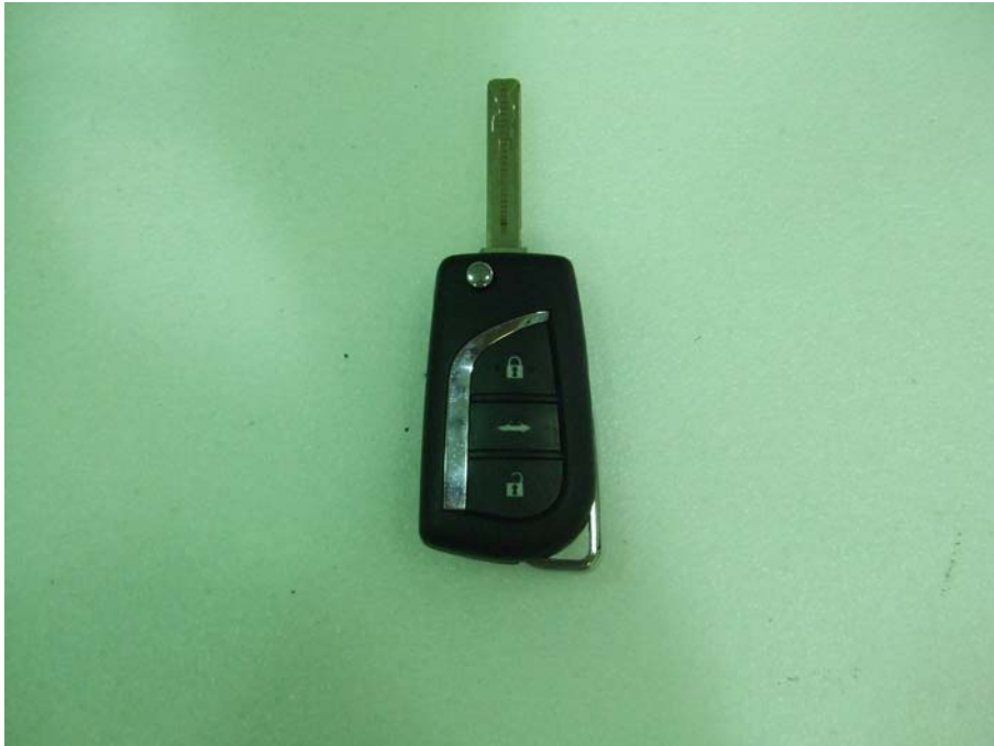
Mechanical Key (folded out) Worst