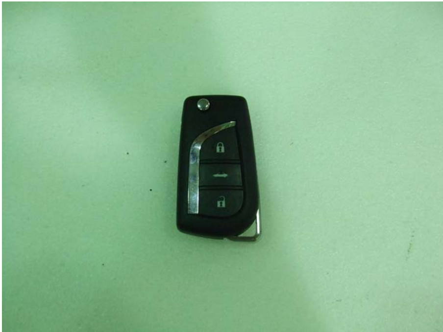
Mechanical Key (folded in)