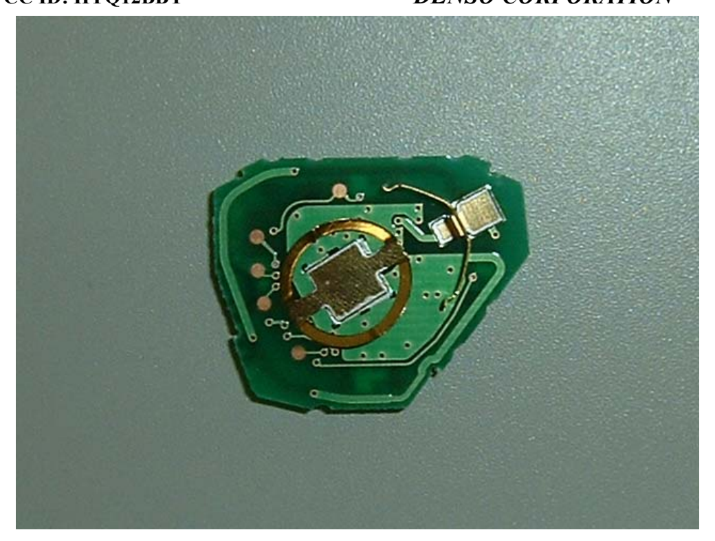
Solder side View