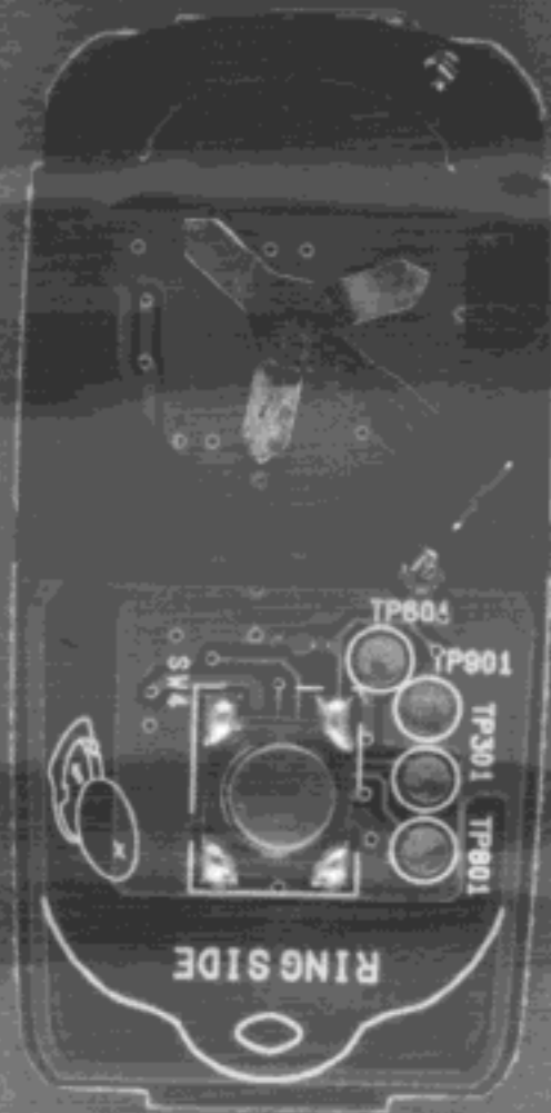
Fig. T5 Transmitter Printed wiring board - Solder side