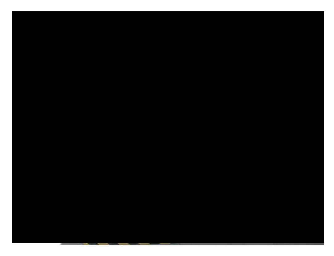
Back View of Radiated Test (Mode 1)