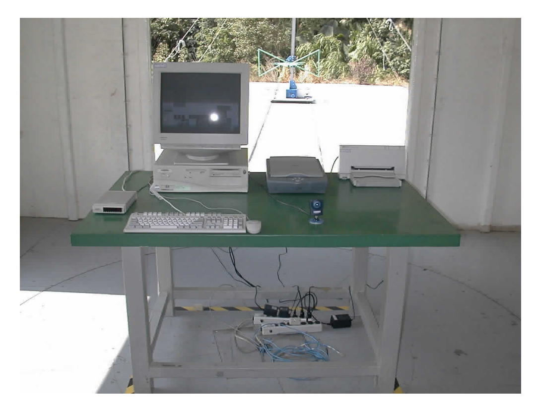
Back View of Radiated Test (Mode 2)