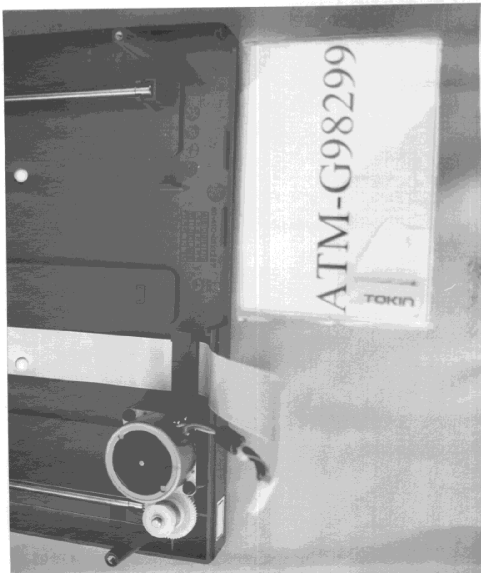
Figure 8 Internal View (Motor View)