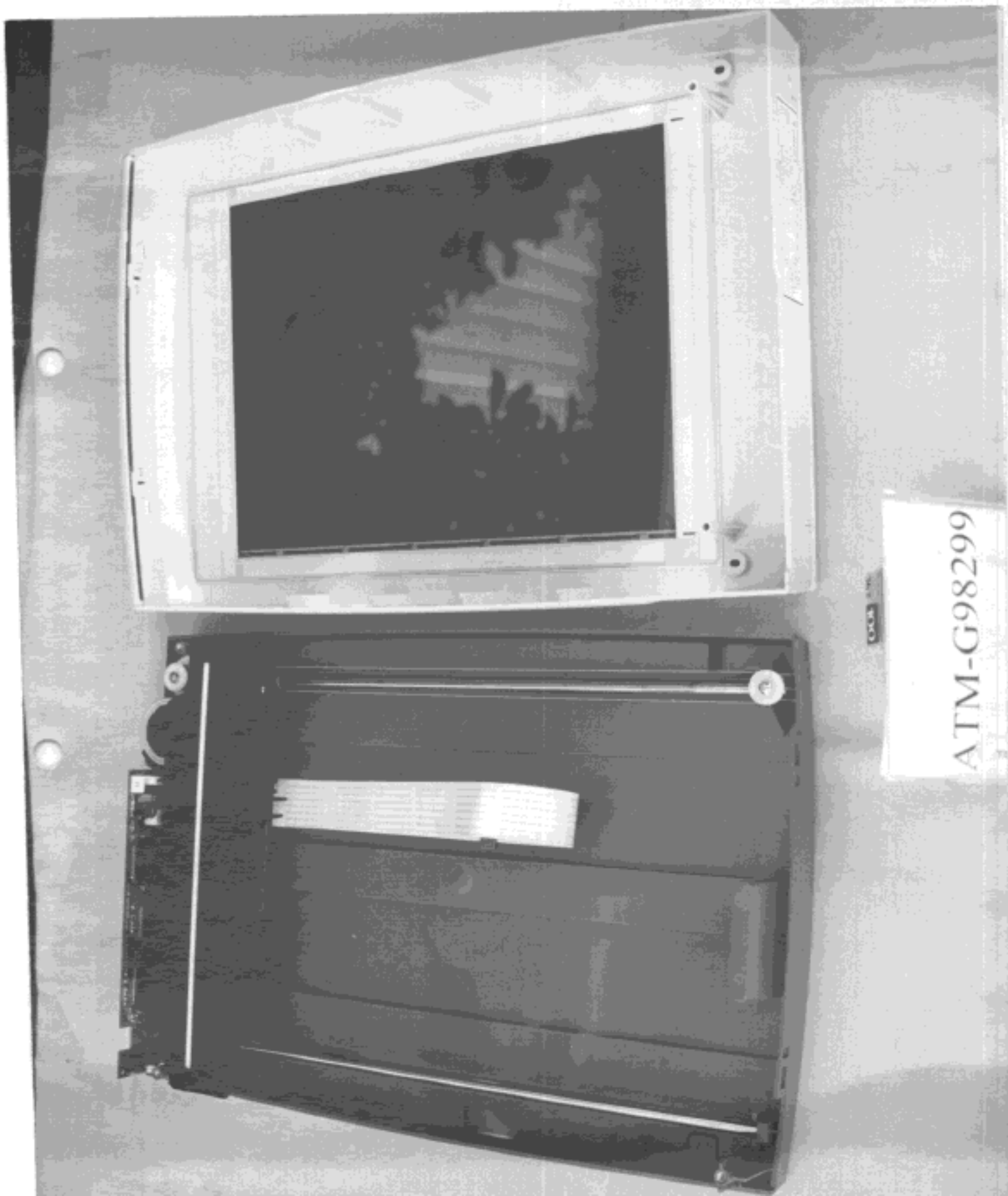
Figure 6 Top Cover Removed, Frame of Internal