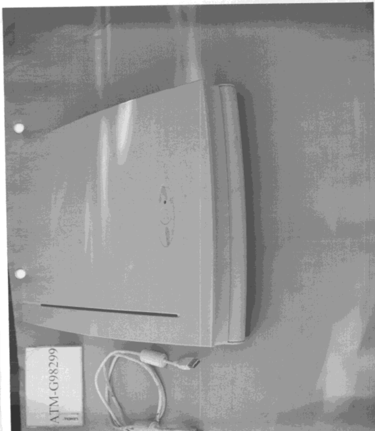
Figure 1 General Appearance (Front View), Data Cable