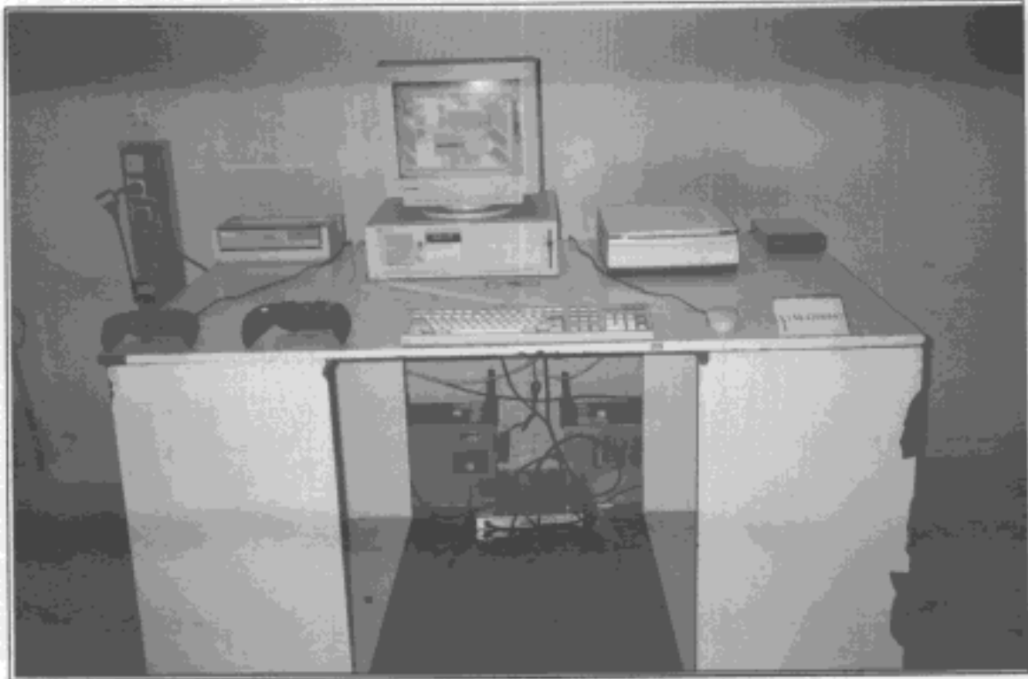
FRONT VIEW OF CONDUCTED TEST