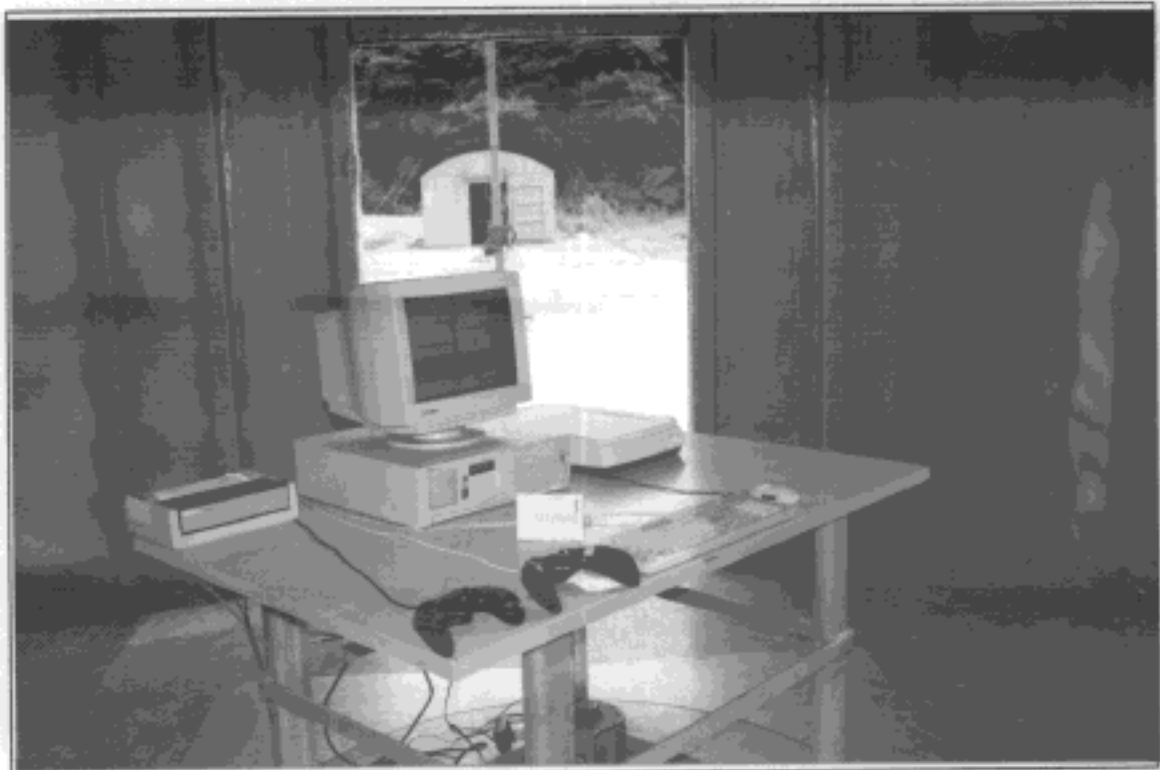
SETUP WITH MAXIMUM DETECTED EMISSION AT VERTICAL POLARIZATION