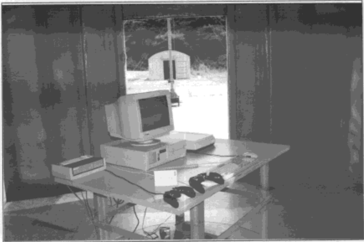
SETUP WITH MAXIMUM DETECTED EMISSION AT HORIZONTAL POLARIZATION