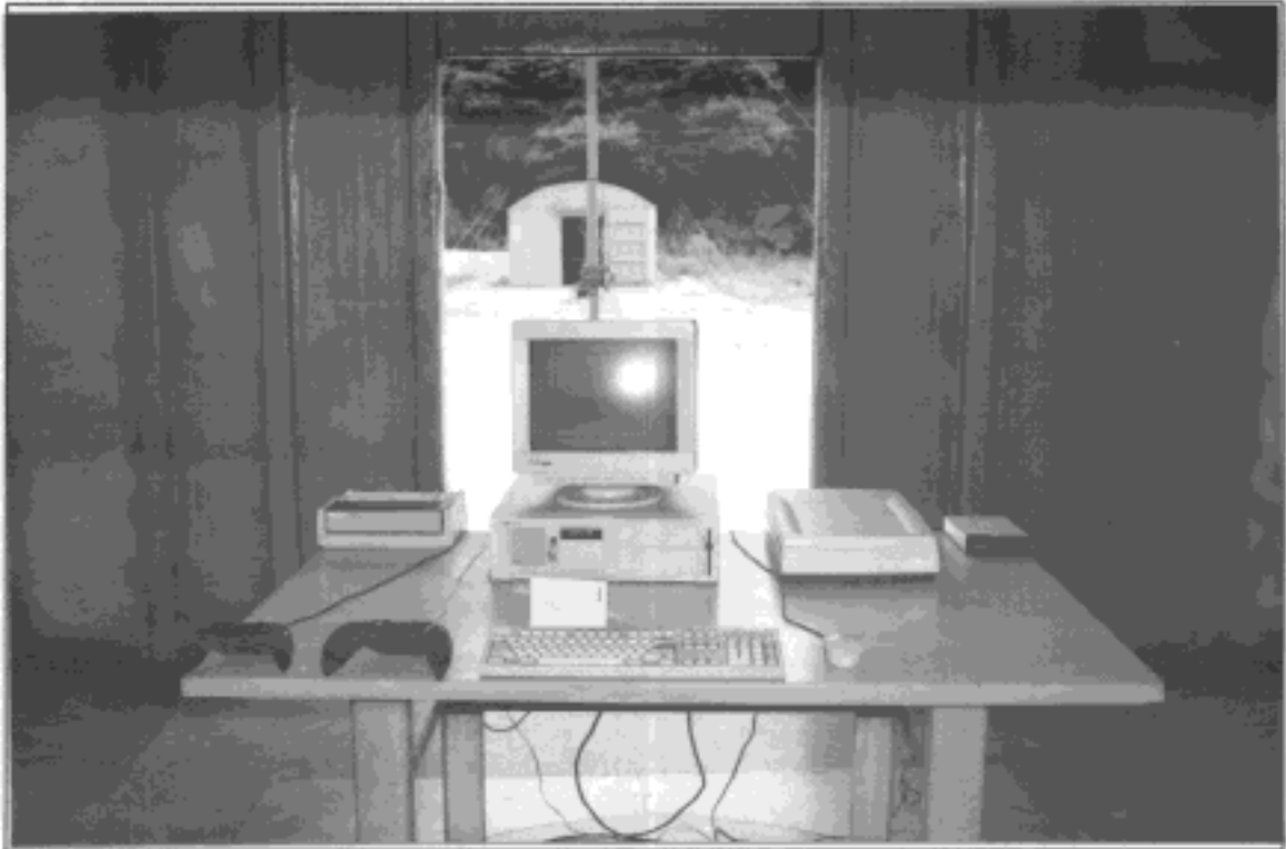
FRONT VIEW OF RADIATED TEST